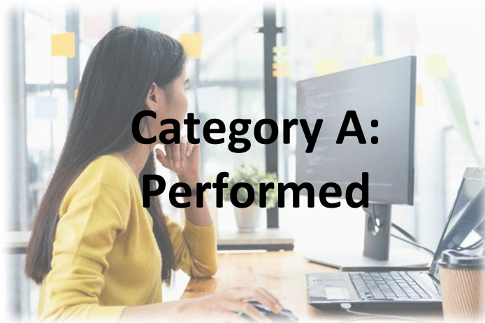
Category A: Performed

>> Recertification by CEUs requires the accumulation of 12 CEUs over a 3-year certification period, which is earned through various activities in 4 separate categories.