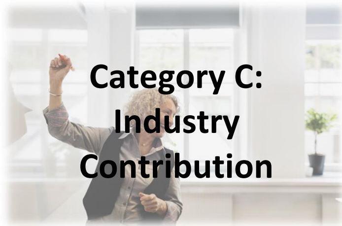
Category C: Industry Contribution