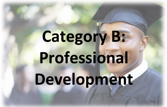
Category B: Professional Development