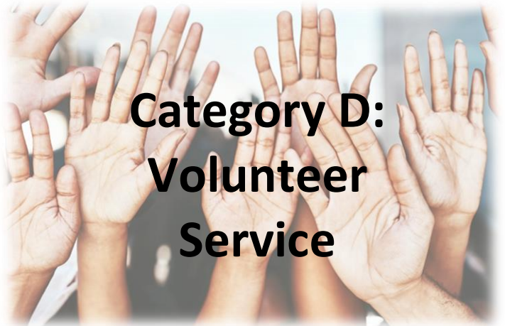
Category D: Volunteer Service