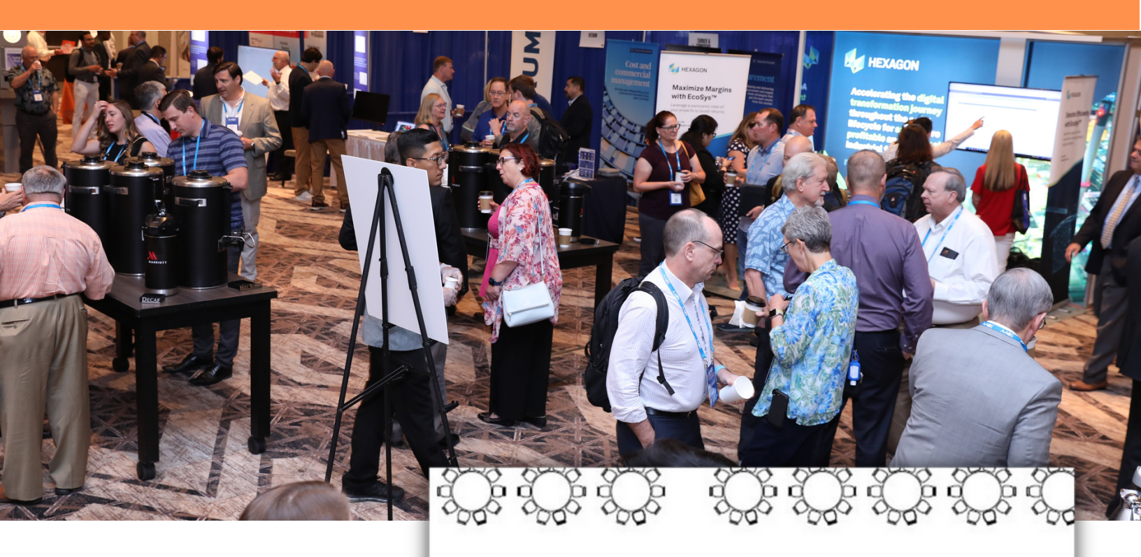
Exhibit booths: All single exhibit booths will be 10' x 10' feet. Exhibitors are responsible for purchasing electric power to be dropped at booths through the GES Exhibitor Toolkit. All exhibit booths are given on a first come, first served basis.